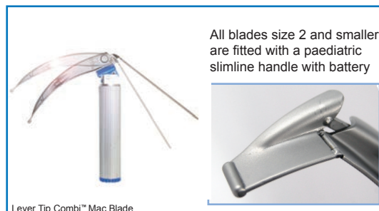
Lever Tip Combi™ Mac Blade

All blades size 2 and smaller are fitted with a paediatric slimline handle with battery